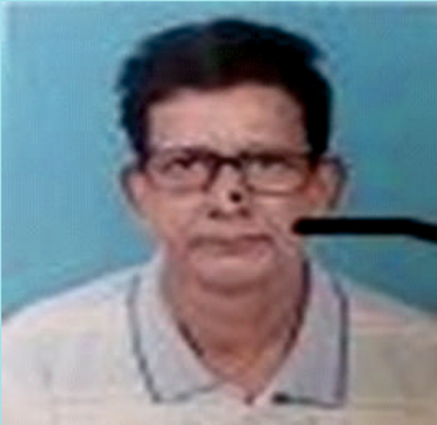
Shri Gopal Chandra Day