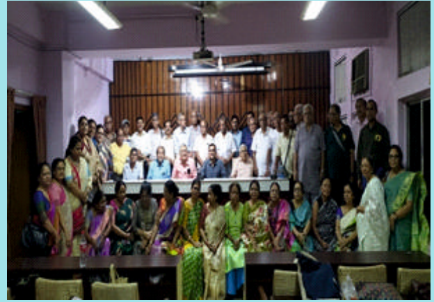
A view of persons present in the get together