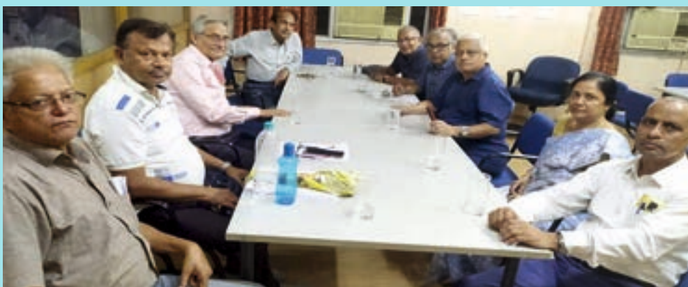
Digital Media Sub-Committee Meeting at ICAR-CIFE