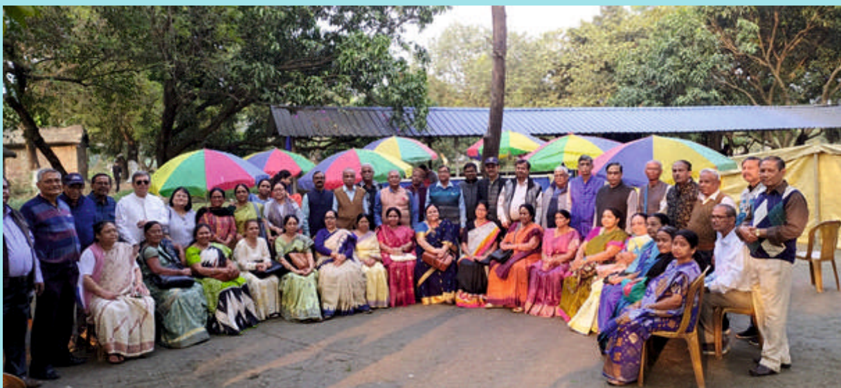
A view of all persons present in the Annual Picnic