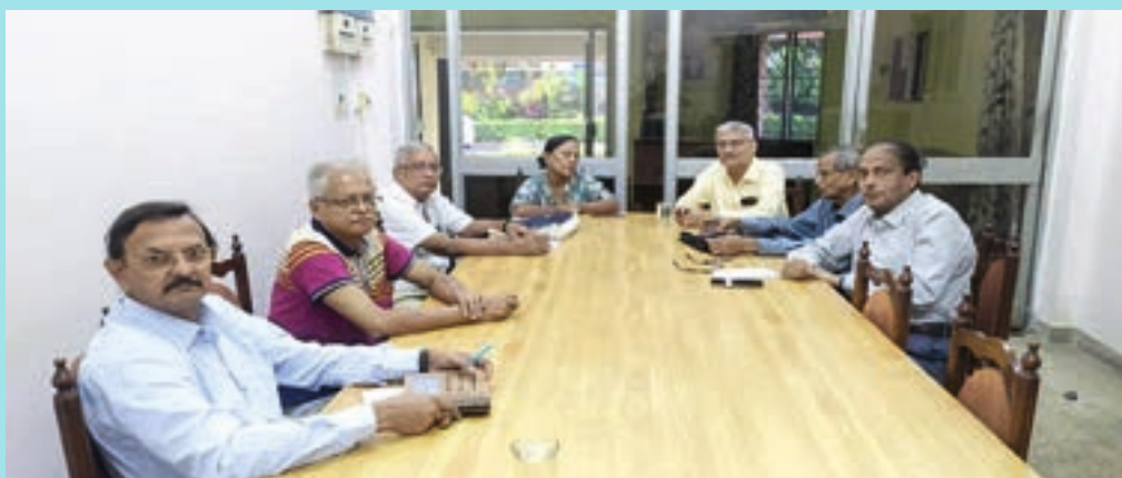
Community Service Sub-Committee meeting held on 13th October, 2023