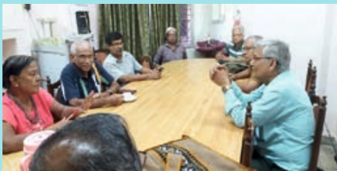
Tour Sub-Committee Meeting for 2023-2024 held on 9th September , 2023