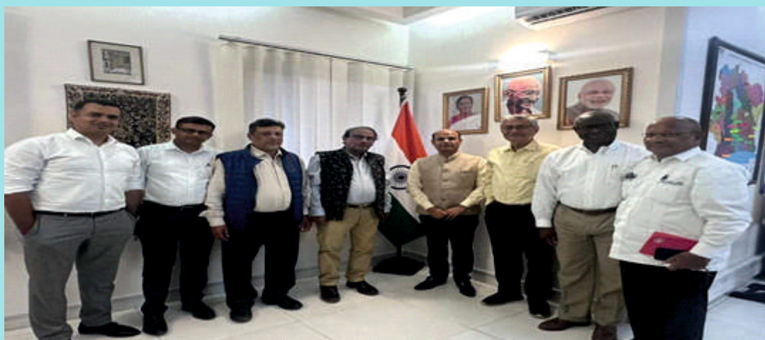
Meeting of ARICARE Members with Indian Ambassador at Ivory Coast (Cote d'Ivoire)