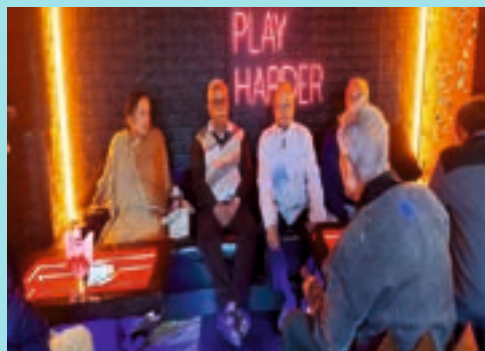
Meeting of Tour Sub-Committee held on 16th January , 2024.