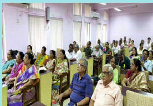
Members/Families present in the programme