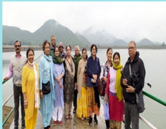
2nd Tour to Daringbadi

Tour to Ghatshila - Tatanagar - Galudi - Dalma was organized with 9 persons from 14th to 17th December, 2023. Places visited were Suhasita Resort, Ghatshila, Jharkhand, Dalma Wild life Sanctuary, Chandil Dam in Subarnarekha Reservoir Project and Tatanagar.