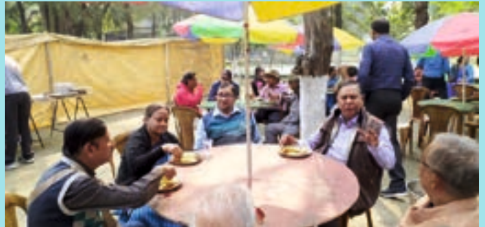
All enjoying the day in gossips along with food / refreshments