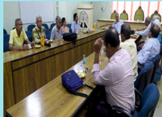
GB Meeting held on 29th August, 2023