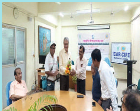
Social and Cultural Sub-Committee Meeting of Aricare held on 5th October, 2023