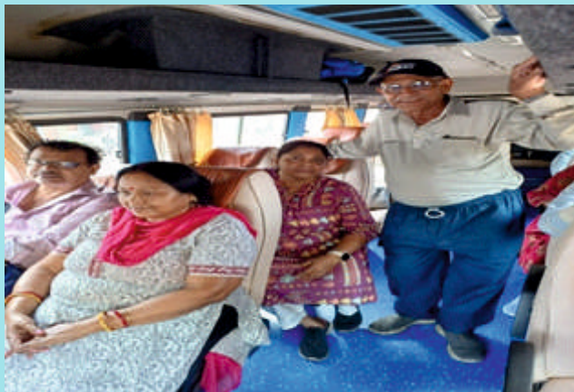
1st Tour to Daringbadi ( Kashmir of Odisha)

2nd Tour to Daringbadi - Gopalpur was organized from 5th to 9th December, 2023 and 10 persons had participated. Visit to Jeerang Monastery, Chandragiri, Gajapati district, Surada Dam and Chilka Lake, Berhampur, Ganjam district of Odisha was also arranged.