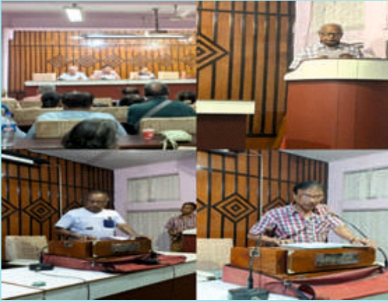
Shruti Drama , Songs and Recitation